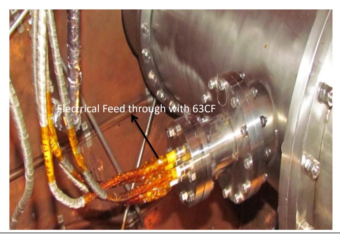
Figure-1 Electrical feed through with 63 CF extended connector at bottom duct