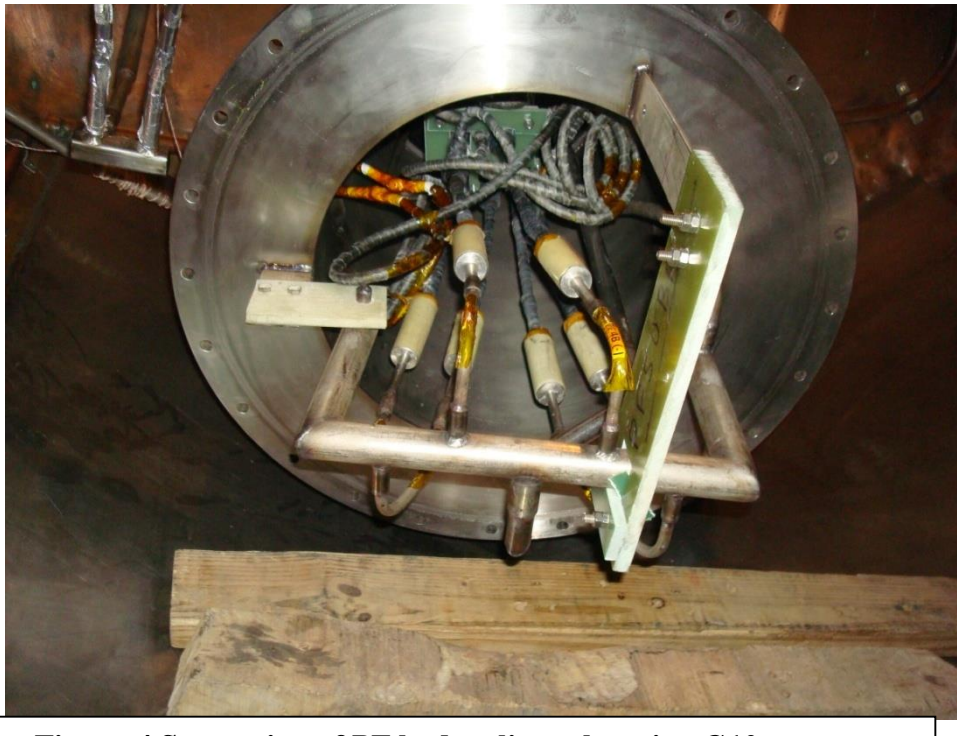
Figure-4 Separation of PF hydraulic paths using G10 supports