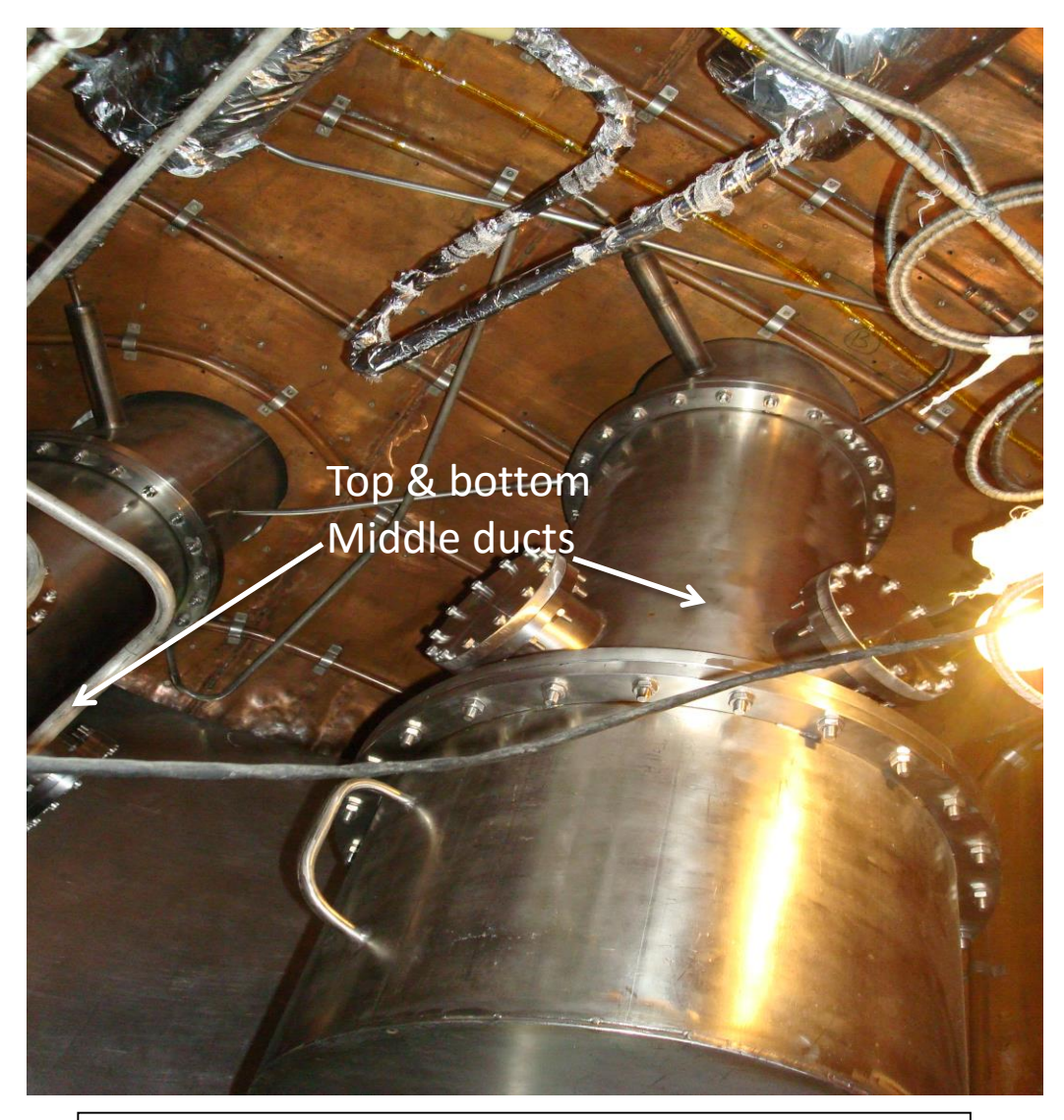
Figure-3 Top and bottom middle ducts inside CFS chamber