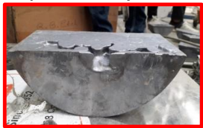
Pb-16 Li ingots produced at IPR

The lead lithium eutectic (Pb-16Li) alloy, enriched at 90% in ^6\text{Li} is a potential candidate as tritium breeder in the liquid metal breeding blanket system of future fusion reactors like ITER and DEMO. It is quite challenging to develop this alloy because the elements lead and lithium have a significant density difference, making it difficult to effectively mix them. This paper discusses the indigenous development of an Pb-16Li production system of capacity 75kg/batch. MHD stirring-based Pb-16Li production system has been in-house developed to cater to the need for Pb-16Li as a process fluid for various Pb-16Li R&D experiments at IPR. A total of \sim 750\text{kg} of Pb-16Li ingots have been produced and characterized to determine the eutectic composition and eutectic temperature. The analytical characterization techniques such as ICP-OES and DSC confirm the eutectic composition of Pb-16at%Li and eutectic temperature in the range of 235\text{-}238^\circ\text{C} respectively. The solidification curve of the produced ingots also suggests a melting point of \sim 235^\circ\text{C} confirming the formation of the Pb-16Li. The homogeneity of the produced ingots was ascertained by SEM analysis which indicates the homogeneous microstructure of the produced alloy.